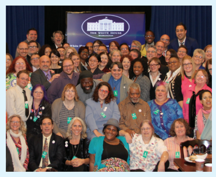
Bisexual advocates at the White House Bisexual Community Policy Briefing on September 21, 2015

Bi Awareness Week takes place annually during the week of Celebrate Bisexuality Day, which has been marked on September 23 since 1999.